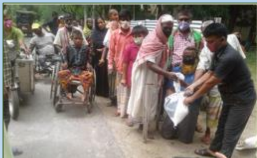
BPKS arranged to distribute rice and other food items to disabled persons in Bangladesh