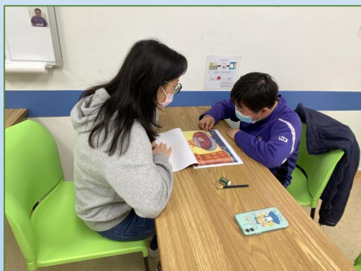
Individual Training on New Normal in MSO