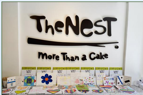
Handmade cards from The Nesbitt Centre

COVID-19 really has brought challenges worldwide. While we were watching the amazing support given to Frontline Medical Staff in other countries we thought, what could we do in HK? Well, our 'Cakes for Heroes, baked by heroes' project was born!! People order cakes from our bakery and we deliver them to the hospitals.