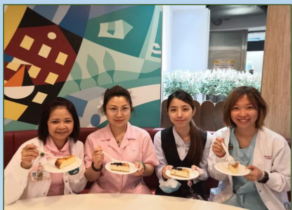
Nurses enjoying the cakes