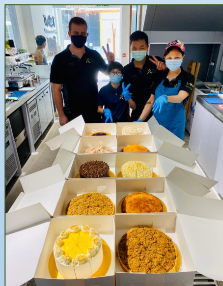
Cakes and other bakeries are on delivery from The Nest Bakery