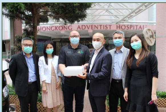
Adventist Hospital Delivery

https://www.scmp.com/video/coronavirus/3082966/hongkongs-bake-cakes-heroes-thank-medical-staff-front-lines-covid-19