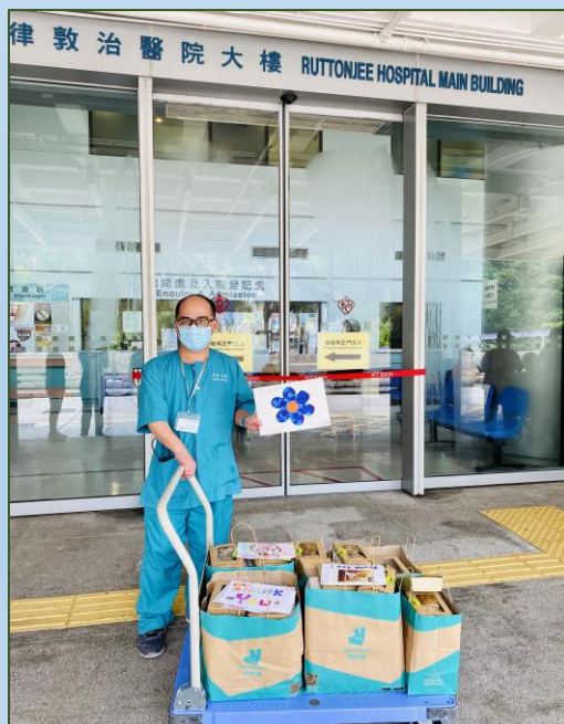
Cakes for the Rutonjee Hospital staff